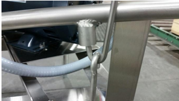
Barrel over hook on spring extension

The barrel socket is placed over the upright hook of the secondary spring extension and pressed downward. The double hook end latches under a horizontal frame member to give leverage. By pushing down the load is taken off of the eye bolt and the nut can be removed or tightened as needed.