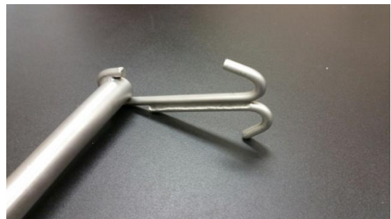
The double hook end of the tool