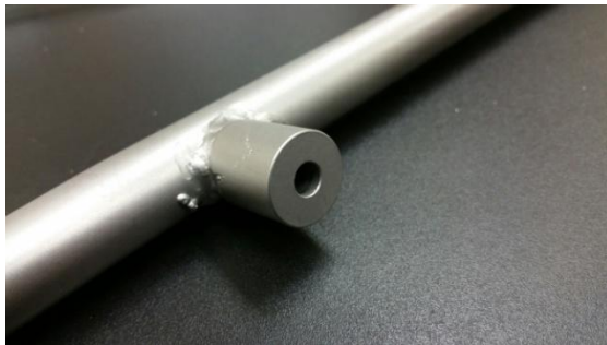
The barrel socket on the tool