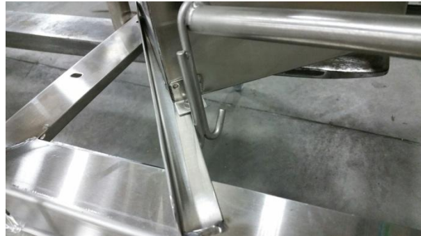
Double hook end under frame member