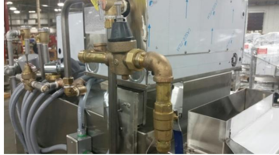
If PRV is required (only if 50psi or above) install here, not supplied