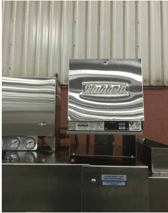
Front view of Left to Right conveyor