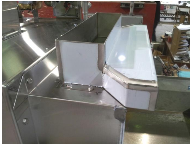
Standard 4" tall (285-6116) vent attachment. Opening is 4x16" and top is 58.25" above finished floor.