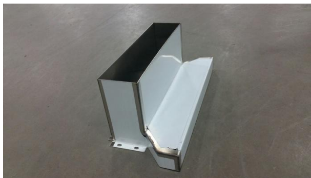
Special 8" tall (285-6258) vent attachment, the top is at 62.25" above finished floor.