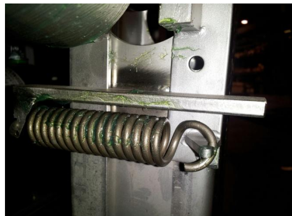
Safety slip clutch spring on rocker arm