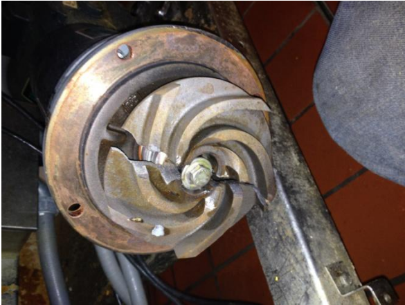
Damaged impeller from excessive start/stop

Overly short clean tables cause damage to apparatus such as motor shafts, conveyor dogs, rocker arm bearings, springs, pumps and impellers. ADS will not warranty damage caused by these short tables.