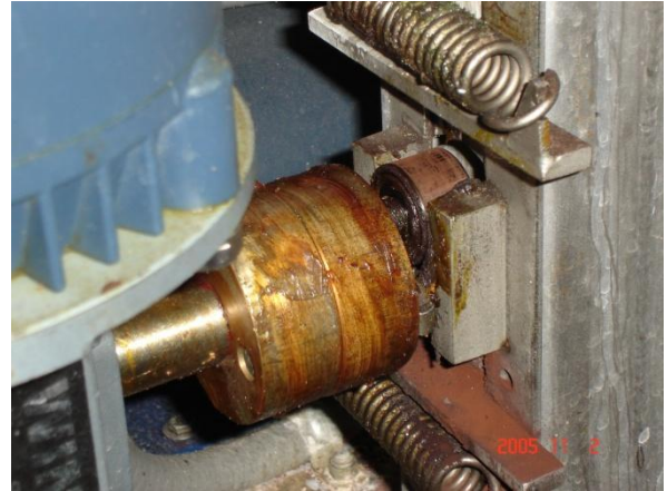
Cam bearing and springs of conveyor