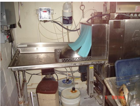
Short clean table on conveyor

When conveyor machines are used with short clean tables without the table limit switch, several problems occur. Pushing racks out against the end of a table causes the rocker arm safety clutch to override the cam bearing. When this safety clutch is used as an operational limit—the springs will fail over time. When racks back up against the safety clutch and extend into the machine, the spring back from the clutch can kick the racks against the sequence bars on the tray track inside, which causes the motor to start/stop with 1.5 seconds. We’ve seen machines left unattended for extended periods, with racks riding the clutch. This continuous action fatigues the metal in both shaft and impeller.