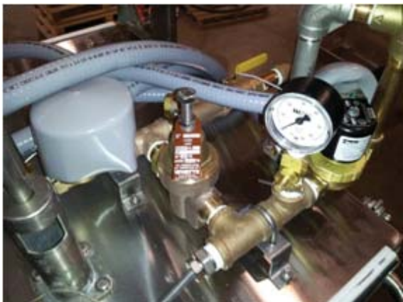
Showing PRV, ASSE approved air-gap, final rinse gauge