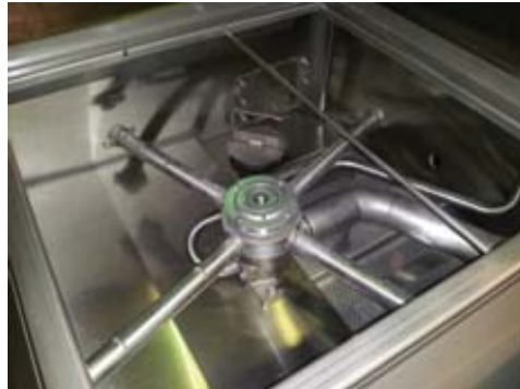
Wash arm w/bearing installed on base