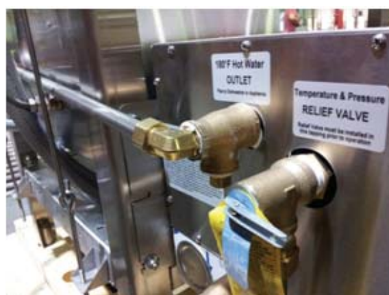
Booster hot outlet line going up to HT-25/34 inlet manifold