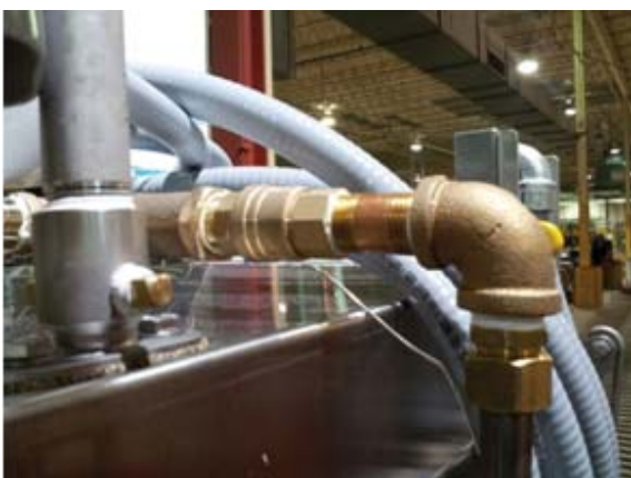
HT hot water inlet ball valve, connected to booster line

BUILT-ON BOOSTER COMBO PLUMBING —Incoming hot water attaches to the lower \frac{3}{4} " inlet on the booster heater. This should come from the building's hot water heater. The dishmachine and booster come pre-plumbed from the factory and pre-wired. The only connection is the incoming hot water to the booster. A pressure reducing valve with by-pass should be installed before the booster heater if the line pressure is 50 psi or above.