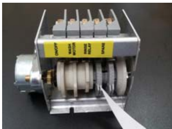
Showing HT-25 cam timer, arrow points to detergent cam

Connect to chemical dispenser terminal blocks located on the left-hand side of the control box, look for yellow decal labeled detergent and rinse. The dispenser wash signal comes from the 4th cam on the cam timer. This cam can be adjusted so a signal for detergent can be set for a certain time or limit during the cycle. The rinse signal comes from the 3rd cam, it last for 10 seconds and is not adjustable. The 5th cam is a spare for future features.