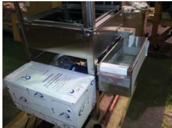
Showing built-on booster mounted in corner position (front)

BUILT-ON BOOSTER COMBO PLUMBING —Incoming hot water attaches to the lower \frac{3}{4} " inlet on the booster heater. This should come from the building's hot water heater. The dishmachine and booster come pre-plumbed from the factory and pre-wired. The only connection is the incoming hot water to the booster. A pressure reducing valve with by-pass should be installed before the booster heater if the line pressure is 50 psi or above.