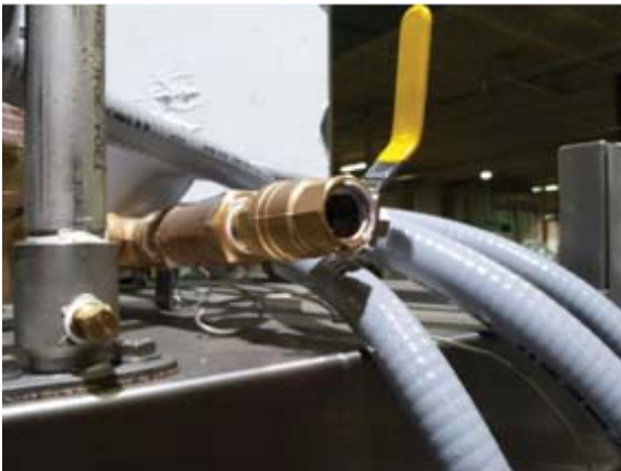
Showing final rinse mixing chamber, hot-water inlet to HT-25

#6 HOODS —Follow all local plumbing and mechanical codes. IMC 2012, section 507.2.2 requires Type II hoods for all commercial dishwashers except where the heat and moisture loads are incorporated into the building’s HVAC systems or dishwashing equipment designed with separate heat and moisture removal systems. A door-type, single-rack, hot-water sanitizing dishwasher is rated at 4770 Btu/h by table 5E, ASHRAE Research Project #1362, 8/5/2008. ADS DOES NOT SPECIFY BUILDING HVAC VALUES.