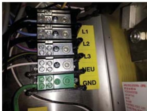
Main distribution block for incoming 5-wire