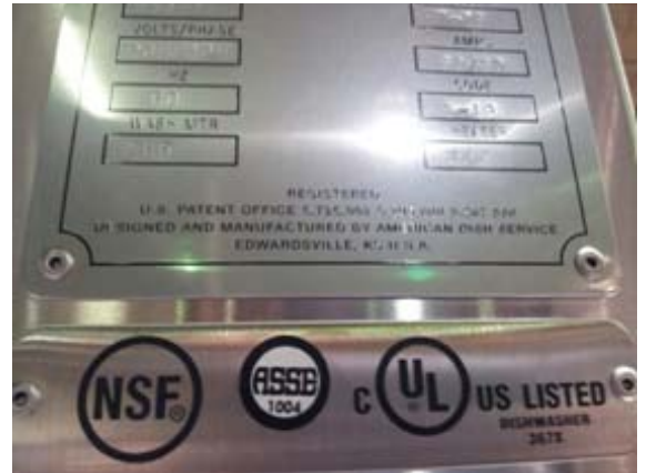
Data plate information and listing marks