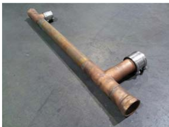
HT-25 drain manifold with "no-hub" connectors