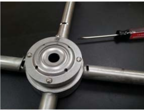
Remove 4 screws and lift top shell