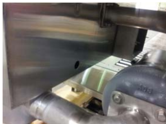
Showing 7/8" detergent probe hole behind pump motor