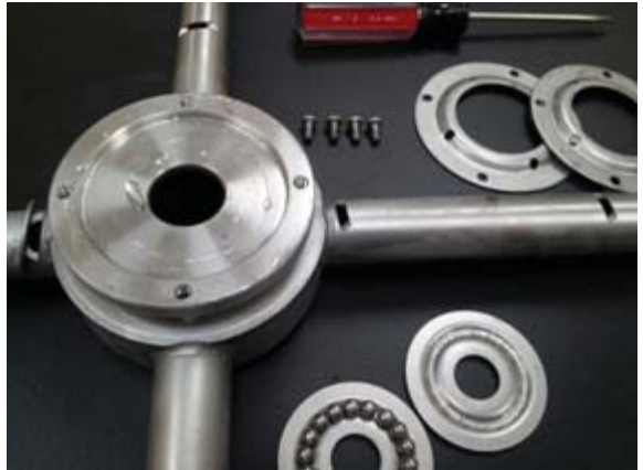
Races are interchangeable, capture shells are also