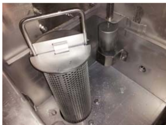
Pump filter in drain sump