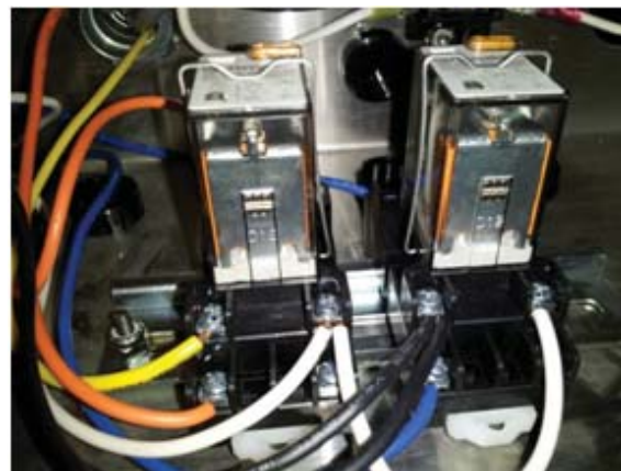
Yellow signal wire from the booster controls heater relay

EXCEPTION—HT-25/34 with booster combo is NOT AVAILABLE in single-phase