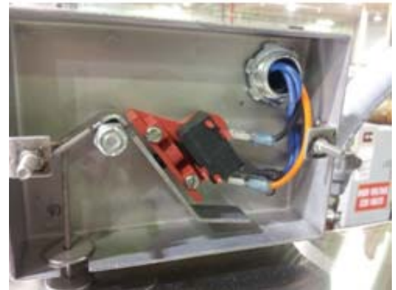
Showing “float” switch that controls fill water & heater

The wash temperature is maintained by a sustainer heater. Record tank temperature during the initial tests. There are two gauges mounted under the control box. Gauges are marked Wash/Final Rinse. Wash tank temperature should be 140°F for chemical sanitizing and 160°F for hot water sanitizing. If tank temperatures are low, increase by adjusting the heater thermostat located behind the wash motor.*