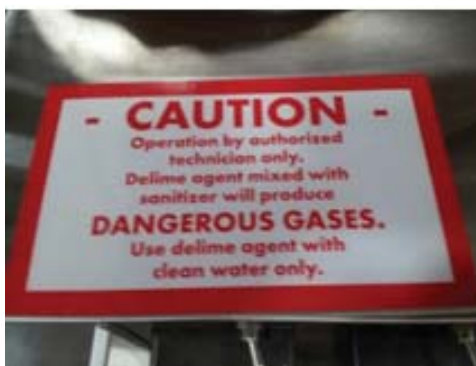
Warning decal about mixing chemicals