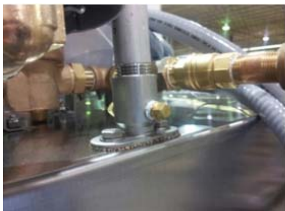
Mixing chamber with two 1/8" pipe threaded port