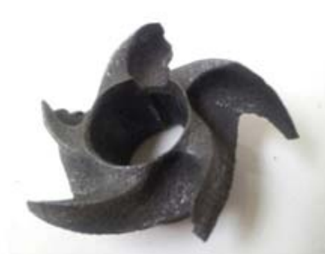
Impeller damaged from high acid solution