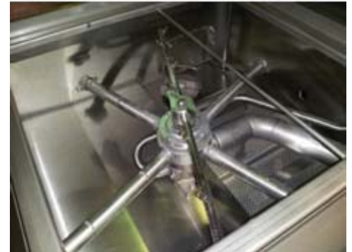
Final rinse arm twisted into transfer tube

Verify incoming water temperatures and final rinse pressure (20 psi during final rinse). Remove any of the white protective film from stainless surfaces such as doors or panels.