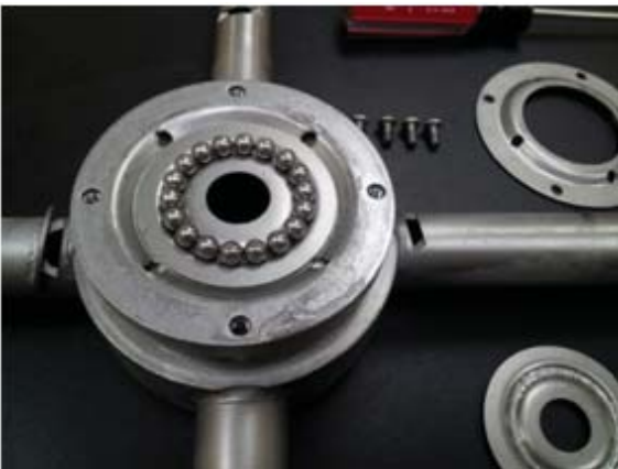
Top race removed, ball bearings for replacement