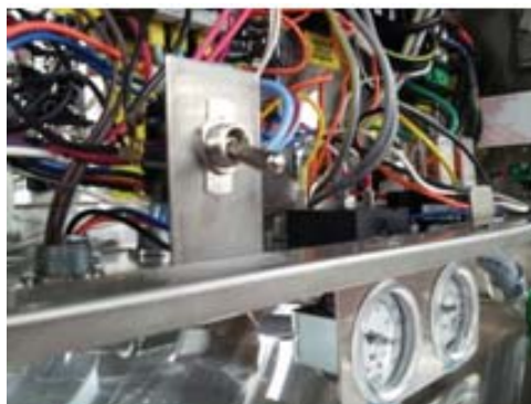
De-lime switch in HT25 control box

Let the machine run long enough to return the inside of the machine to the appearance of shiny metal surfaces. Then empty and refill the tank with fresh water. It is best to de-lime more often with milder acid solutions than waiting until there is heavy build up of white minerals, then trying to remove the build up with very strong acid concentrations. Using too strong of an acid solution or running it for very long periods of time will erode the metal of the impeller because it is spinning in the acid solution. If the final rinse arms are clogged with mineral deposits, remove from the machine and soak them in a pan with lime remover.