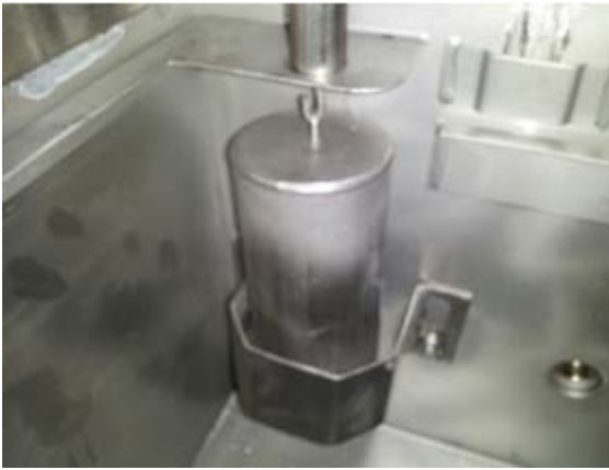
Wash tank float and tank overflow