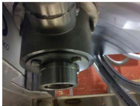
Drain sump connection for copper drain, bottom of tank