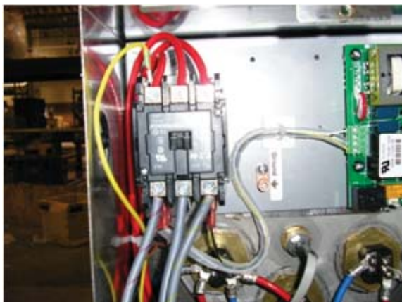
Showing booster contactor, yellow signal wire

BUILT-ON BOOSTER COMBO ELECTRICAL—The combo package uses an inter-latch circuit to turn off the dishmachine sustainer heater anytime the booster turns on. In this feature, there is only one heater circuit energized at a time— allowing both booster and dishmachine to be installed on one 50a service. Connections in the booster heater come from the HT-25/34 control box. The gray 3-phase power wires come from the 50a breaker in the HT-25/34 control box and connect to the incoming side of the booster contactor. The single yellow wire connects to the heater side of the contactor on the L1 terminal circuit. Then the yellow wire connects in the HT-25/34 box to the relay controlling the dishmachine sustainer heater. The dishmachine and booster combination come pre-wired from the factory.