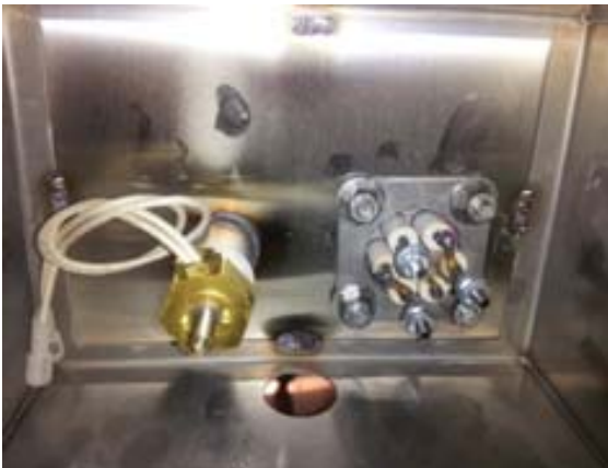
Showing thermostat and sustainer heater terminals*

To operate, connect the breaker for main power and turn “ON” the dishmachine master switch. Water will automatically fill to an operational level. After several cycles when final rinse water increases the tank water level, the tank water will overflow to the scrap box. Place a rack of dishes in the machine, close the door and the cycle will begin.