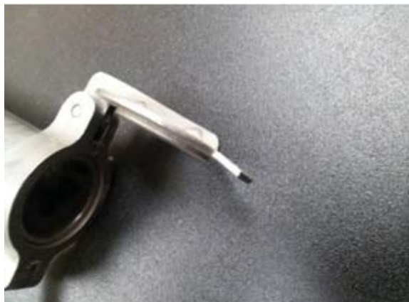
Tab on endcap bent inward, causing loose fit

Showing repair of loose end cap when tab on the cap has been forced close or bent on material such as seeds or tooth picks.