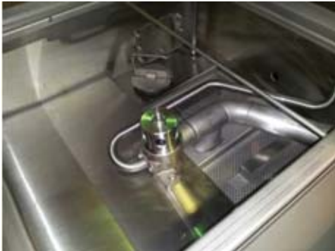
Showing spray arm base & transfer tube

Open doors and remove all packaging, including cardboard supports found under the wash tank heater. Do not dispose of packing material until you remove spray arms. Packing materials contain the installation manual, QC check sheets; upper and lower wash and rinse arms. Prior to connecting the main power supply, tighten all wire connections looking for those that loosened during shipping or moving. Before turning on the water, if the chemical dispenser has not been installed, plug the probe and chemical delivery holes in the wash tank and plug the mixing chamber injection ports. Turn on the water supply. Check and correct any leaks throughout the machine. After the first fill and completed cycle, drain the tank then install wash and rinse spray arms, both upper and lower. They are interchangeable top to bottom.