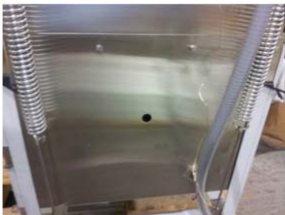
Showing back of tank, 7/8" detergent bulkhead fitting hole

ADS provides two (2) ports, 1/8" IPS female threads in the final rinse mixing chamber for dispenser check valves. Probe hole (7/8") is provided in the wash tank for probe installations (install probe before operating the machine). Detergent hole (7/8") is provided for bulk-head fitting (install fitting before operating machine).