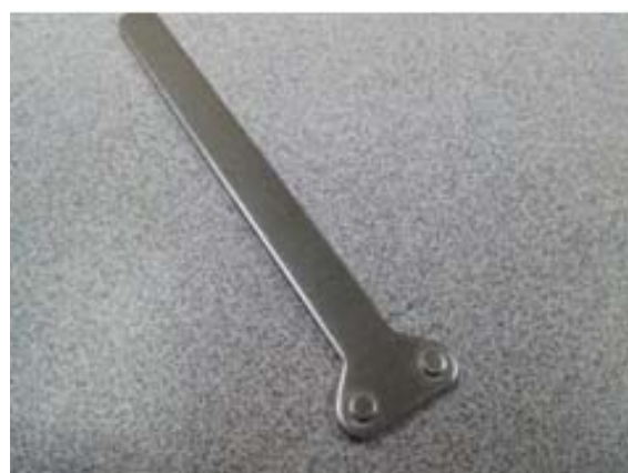
Cam adjusting tool

TESTING FOR TEMPERATURE —For high temp sanitizing, the measurement is taken at the manifold for a minimum of 180°F, NOT in or at the sprays. If tapes are used to verify temperature, then only 165°F labels should be used, this is the temperature required on the surface of the plates--NOT 180°F. This is according to the NSF/ANSI Standard 3 test protocol.