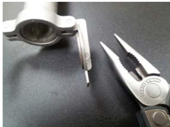
Straighten tab in line with the coin edge to tighten