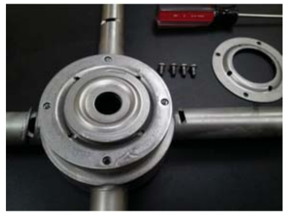
Remove top shell, exposing top bearing race