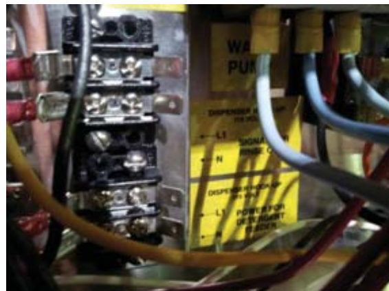
Showing dispenser signal connection terminals

NOTE: Before turning on the water, if the chemical dispenser has not been installed, plug the probe and chemical delivery holes in the wash tank and plug the mixing chamber injection ports.