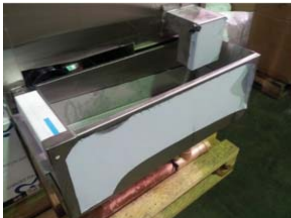
Scrap box and 2" drain manifold attached to pallet for shipping

ADS provides a 2" copper drain manifold for the tank and scrap box, the manifold is shipped strapped to the pallet of the dishmachine. After installation, attach the drain manifold using the rubber "no-hubs" on the manifold. To prevent clogging, run drain lines as straight as possible. Do not plumb with tight radius elbows or 180° bends. Use of floor sinks for drains can cause flooding. Do not use reducing adapters for drain lines, always use 2" diameter pipe or larger. Always run gravity drain lines downhill.